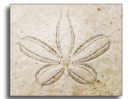
Sand Dollar (Clypeasteroida)