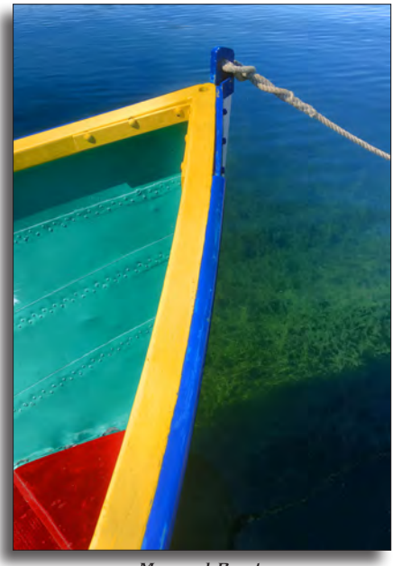
Moored Boat

s you may know, I retired in April and since then I've been on the road a good bit and photographing more than ever. I think the more photographs you take, the odds of capturing something special increase. I am very happy with a number of recent images, but this one is my favorite. I found the boat tied up to a pier