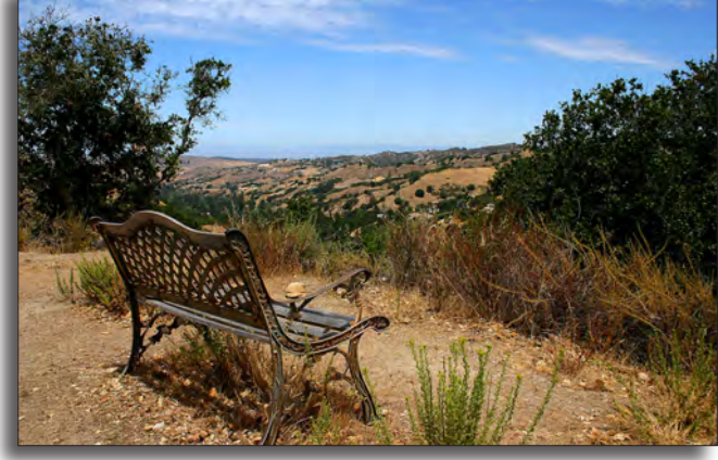
Black Ranch Overlook

The slideshow is up on our website (Thank you, Jared !). Click on "In the Field," in the right column of the home page. Here are a few images from the shoot, which should give you an idea of why this day was such a special one.