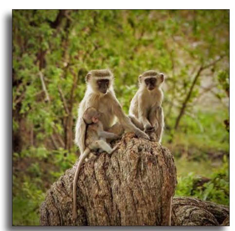
Vervet monkey suckles baby while older daughter waits