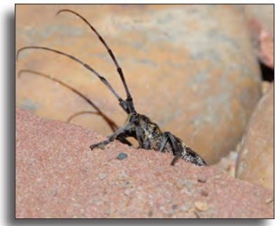
Beetle, New Mexico