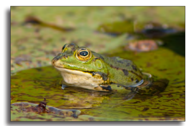
Pond Frog - Rana ridibunda - Image by Elke Ikeda