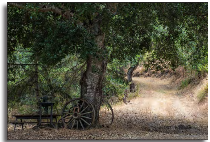
Dusty Road