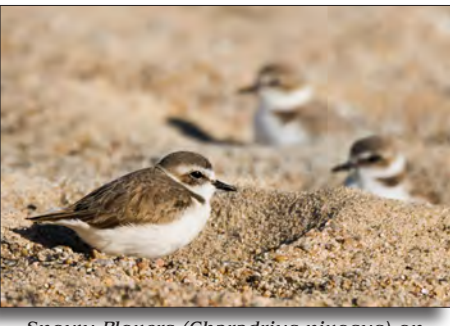
Snowy Plovers (Charadrius nivosus) on Carmel River Beach in February

are a few of the images that did not win a judge's choice, but are outstanding nonetheless. Congratulations to all who participated.