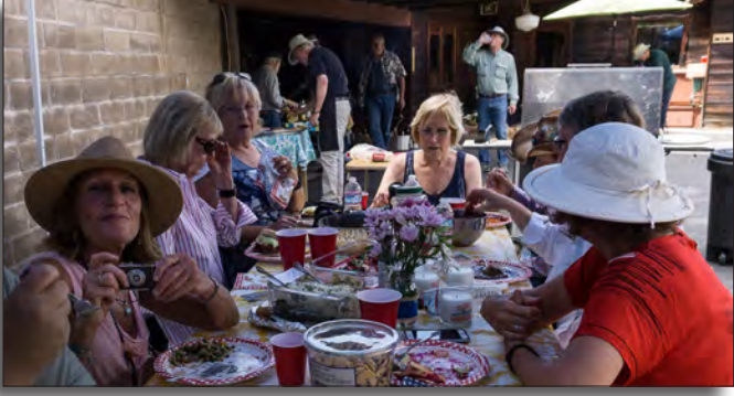
Lunch Time