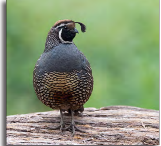
California Quail (Callipepla californica)